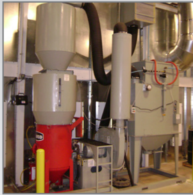
Pneumatic, Abrasive Recovery System