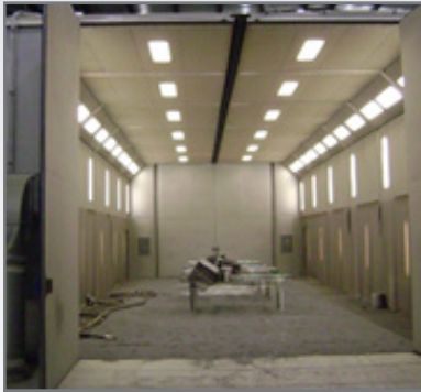
Drive-through, crane slot, manual metal doors

A Blast Enclosure is a metal structure that protects the blasting operations from the elements and contains it from other work areas. By enclosing the blast operations, you can now operate regardless of daylight or weather conditions. A Blast Enclosure also contains the used abrasive for easier cleanup and re-use. Blast Enclosures can be configured with one or multiple product doors that are steel or rubber. Lighting can be fluorescent or LED and located in the ceiling or side walls.