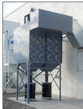
Outdoor unit, top-mounted fan