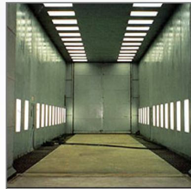
Mechanical, Multiple Long Augers