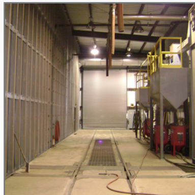
Mechanical, Single Long Auger