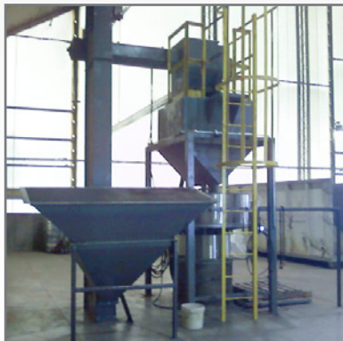
Mechanical, Shovel-In Hopper