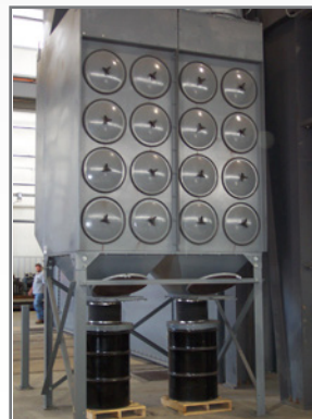
Indoor unit, top-mounted fan