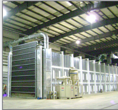
Large equipment enclosure, electric rubber doors